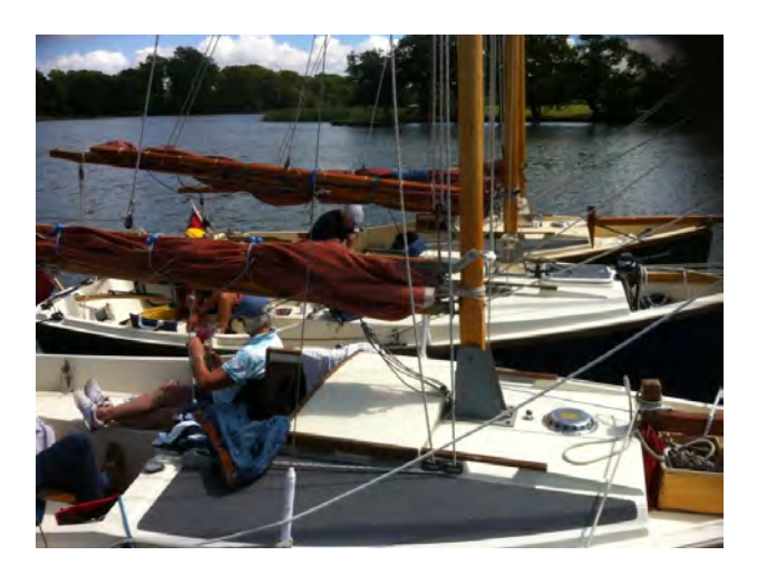
Rafted at anchor in the Pool

It was then back to berth 2 abreast on the fuel pontoon at Buckler's Hard followed by an evening BBQ on the green. This was next to the demonstration area for wooden ship building skills and we were able to use the oak chippings on the BBQs!